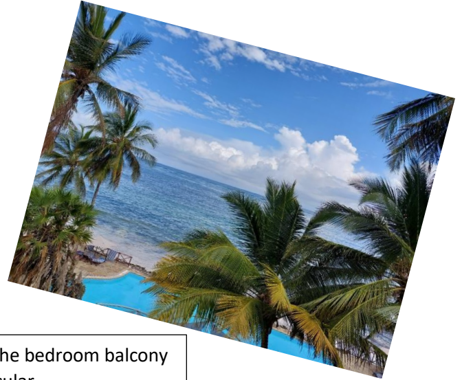
View of the gardens and from the bedroom balcony – quite spectacular