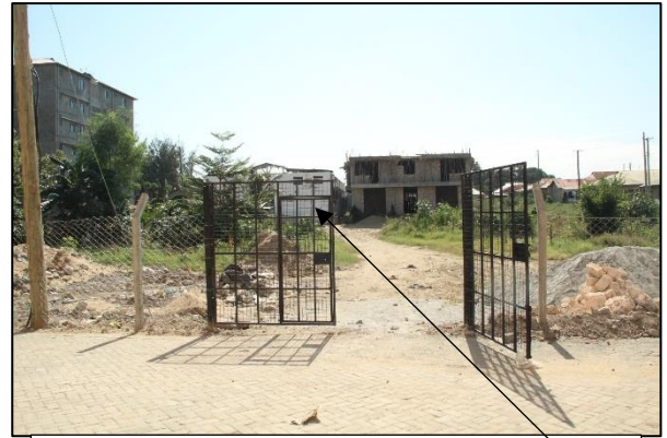
Proximity to school