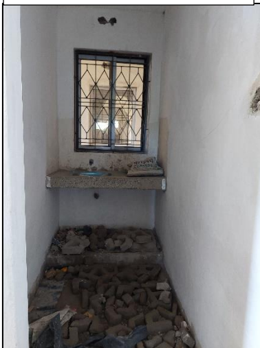
The tiny kitchen

The flat has a tiny kitchen, minute toilet, small living area and small bedroom. But it's safe and secure