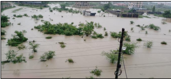
Bombolulu in flood. The worst flooding in recent memory due to persistent rainfall over a sustained period