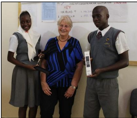
Meeting your sponsored children is unforgettable – they are so grateful

Please do consider visiting the children and their school. You would be more than welcome.