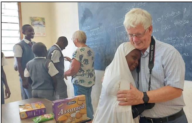
Saying goodbye was hard