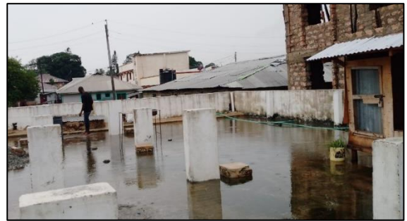
The roof of the school – like a swimming pool