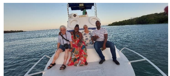
It's not all hard work when you visit though 😊